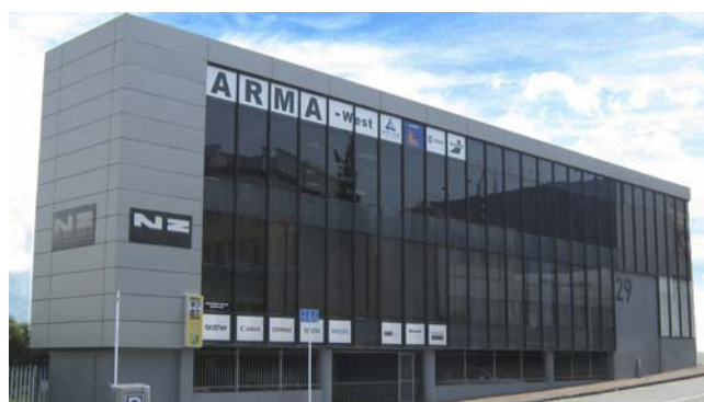
ARMA-West building in Auckland.

performance against a set of common benchmarks when compared with the areas serviced under traditional contracts. Value for money and fit for purpose improvement strategies to achieve the targeted level of service within the available budget are paramount.